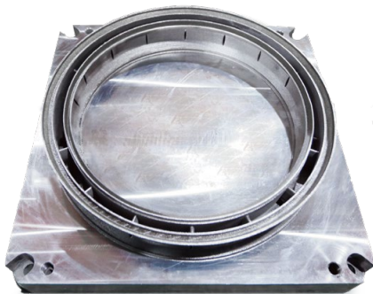
Engine leaf ring structure 316L stainless steel φ 400*60mm 3