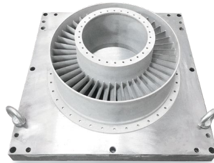
Engine turbine casing assembly IN718 high temperature alloy φ 410*240mm 3