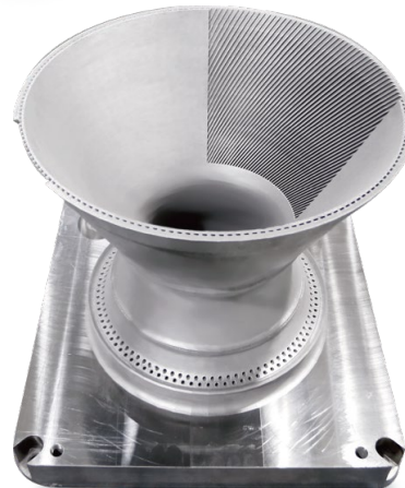
TC4 titanium alloy φ 393*340mm 3